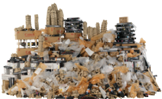
Laser = 815 lbs

Total waste produced from printing 22,000 pages per month for 4 years.